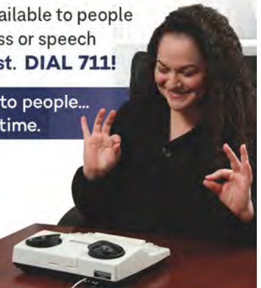
New York Relay Service is funded by New York's Telecommunications Carriers.