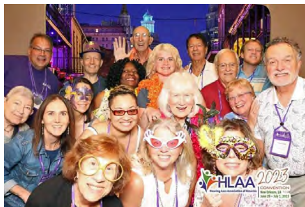
The Rochester crew and friends at the Convention